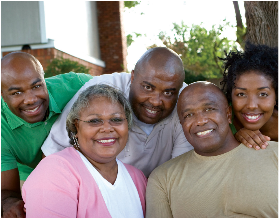
A person's genes can affect how likely they are to develop Alzheimer's disease.